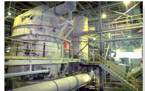
FIGURE 1: Evaporator for sodium carbonate monohydrate crystal growth

Process testing showed that hydrogen peroxide (peroxide) could oxidize the waste liquor's total organic content (TOC) sufficiently to utilize the liquor as a seed solution for the production of an industrial grade soda ash. However, the required batch detention time as well as plant safety concerns over the storing and handling of peroxide made chemical oxidation an unattractive option.