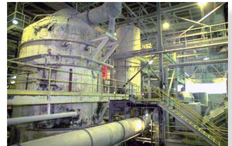
FIGURE 1: Evaporator for sodium carbonate monohydrate crystal growth

Process testing showed that hydrogen peroxide (peroxide) could oxidize the waste liquor's total organic content (TOC) sufficiently to utilize the liquor as a seed solution for the production of an industrial grade soda ash. However, the required batch detention time as well as plant safety concerns over the storing and handling of peroxide made chemical oxidation an unattractive option.