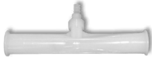
1½-inch Model 1584-TC

ECTFE with 1½-inch tri-clamp inlet/outlet connections and built-in check valve. Flow is 31gpm at 15psi of injector inlet pressure.