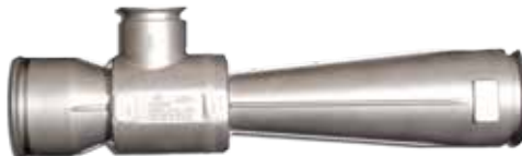
3-inch Model 3090

ECTFE with 2-inch tri-clamp inlet/outlet connections and 1½-inch tri-clamp suction port. Flow is 57gpm at 15psi of injector inlet.