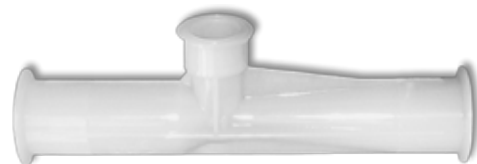
2-inch Model 2081-TC3

ECTFE with 1½-inch tri-clamp inlet/outlet connections and built-in check valve. Flow is 31gpm at 15psi of injector inlet pressure.