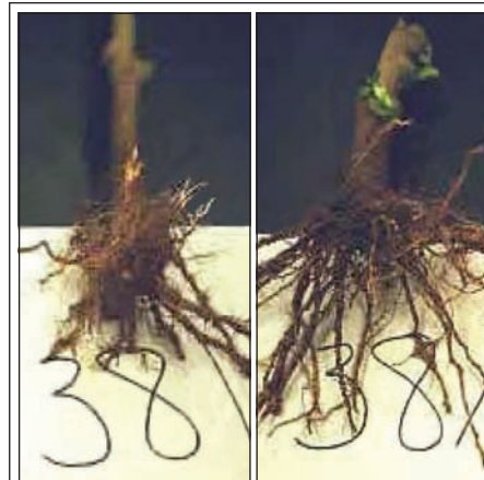
Root mass is significantly increased in bell pepper plants with AirJection® Irrigation (right) in comparison to water-only irrigation (left).