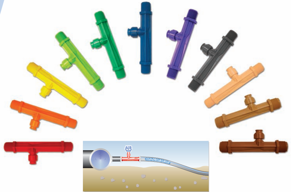
• Above-ground Water Supply Line • Above-ground Mazzei® Injectors

Improves crop yields and water use efficiency.