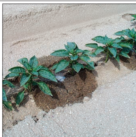
AirJection® Irrigation delivers both water and air to the root zone of the plant.