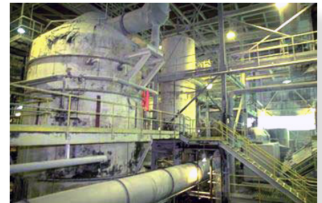
FIGURE 1: Evaporator for sodium carbonate monohydrate crystal growth

Process testing showed that hydrogen peroxide (peroxide) could oxidize the waste liquor's total organic content (TOC) sufficiently to utilize the liquor as a seed solution for the production of an industrial grade soda ash. However, the required batch detention time as well as plant safety concerns over the storing and handling of peroxide made chemical oxidation an unattractive option.